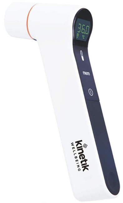
Roll over image to zoom in